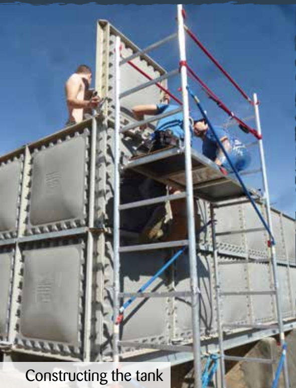
Constructing the tank