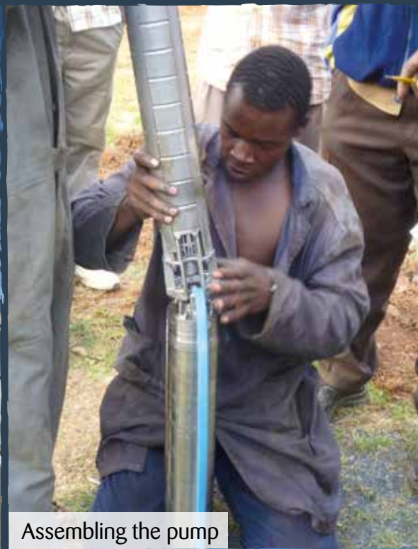
Assembling the pump